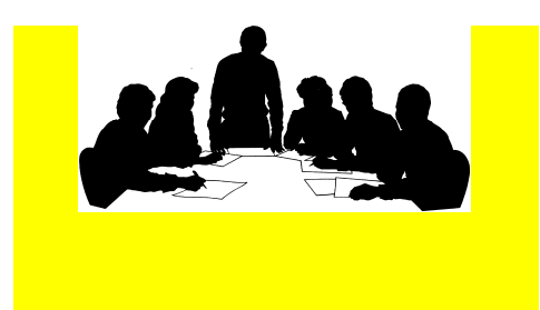
(This month we are including a longer than usual report to give you a better idea of what is happening with the board.)